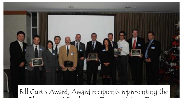
Bill Curtis Award, Award recipients representing the Olympic and Paralympic Transportation Team

BC Ministry of Transportation, TransLink, City of Vancouver, VANOC, BC Transit, Transport Canada, City of Richmond, District of West Vancouver and the Resort Municipality of Whistler